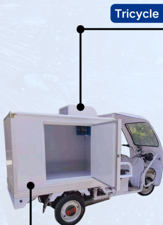
Tricycle Refrigeration Unit